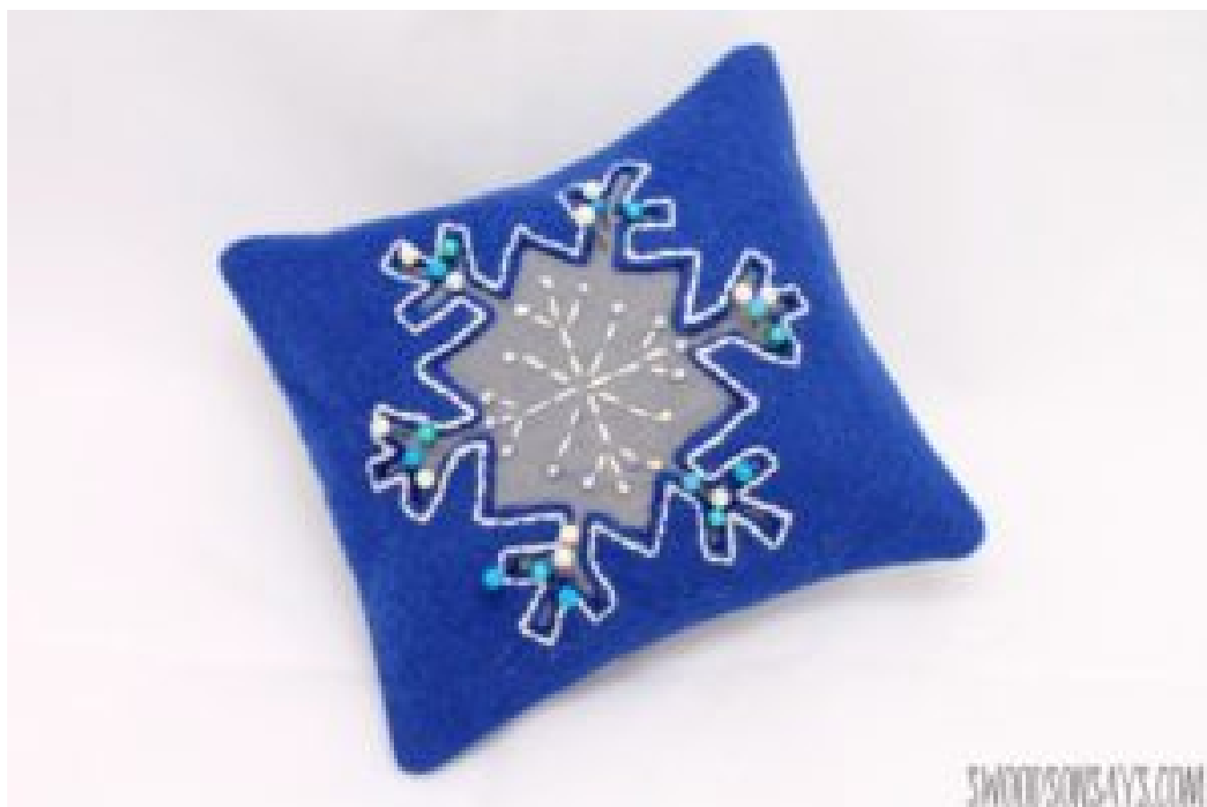
Embroidered Reverse Applique Snowflake Pincushion - by Swoodson Says