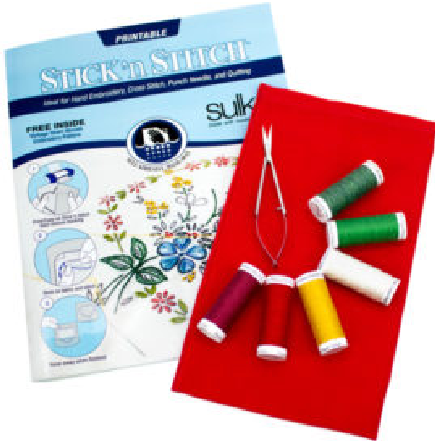
Hand Embroidery Kit - Christmas edition