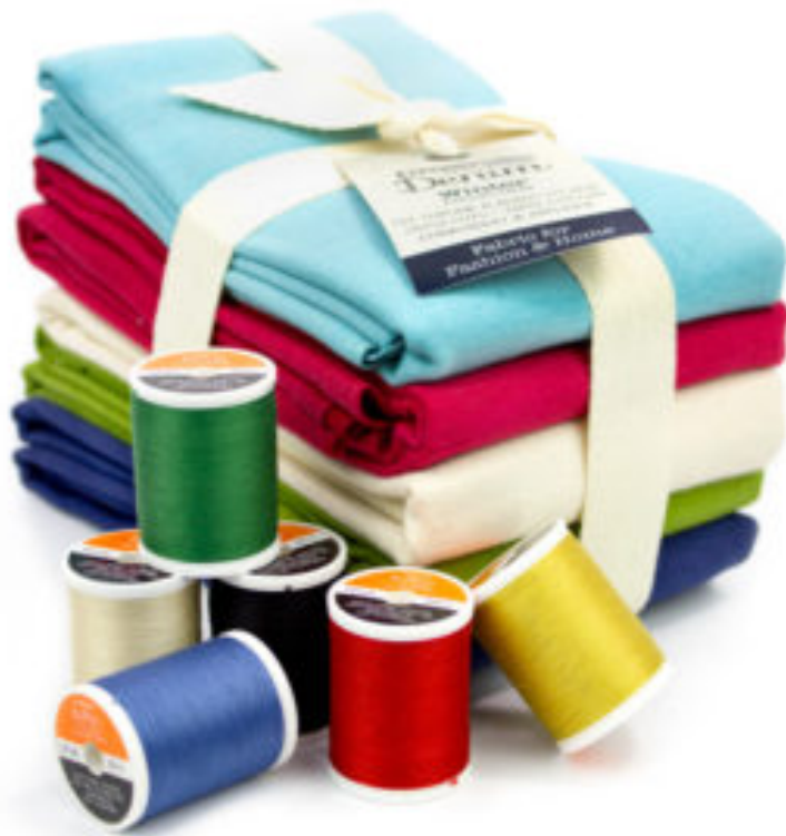
Amy Barickman Crossroads Winter Thread and Fabric Bundle

For some unique, fun projects to make with Crossroads Thread and Fabric visit Indygo Junction . Here a few super creative and neat gift ideas: