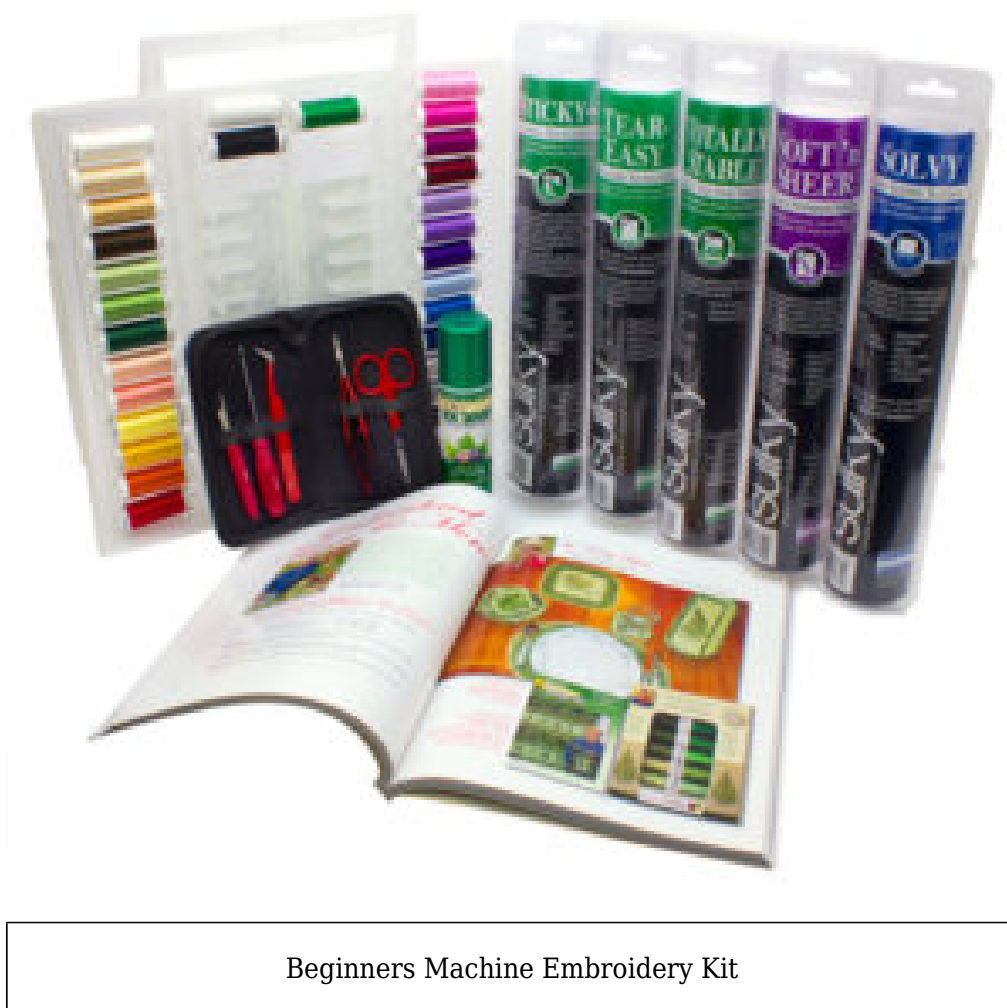
Beginners Machine Embroidery Kit

And guess what? All of our Christmas Embroidery Designs on the Sulky Embroidery Club Website are 50% off for Christmas in July!