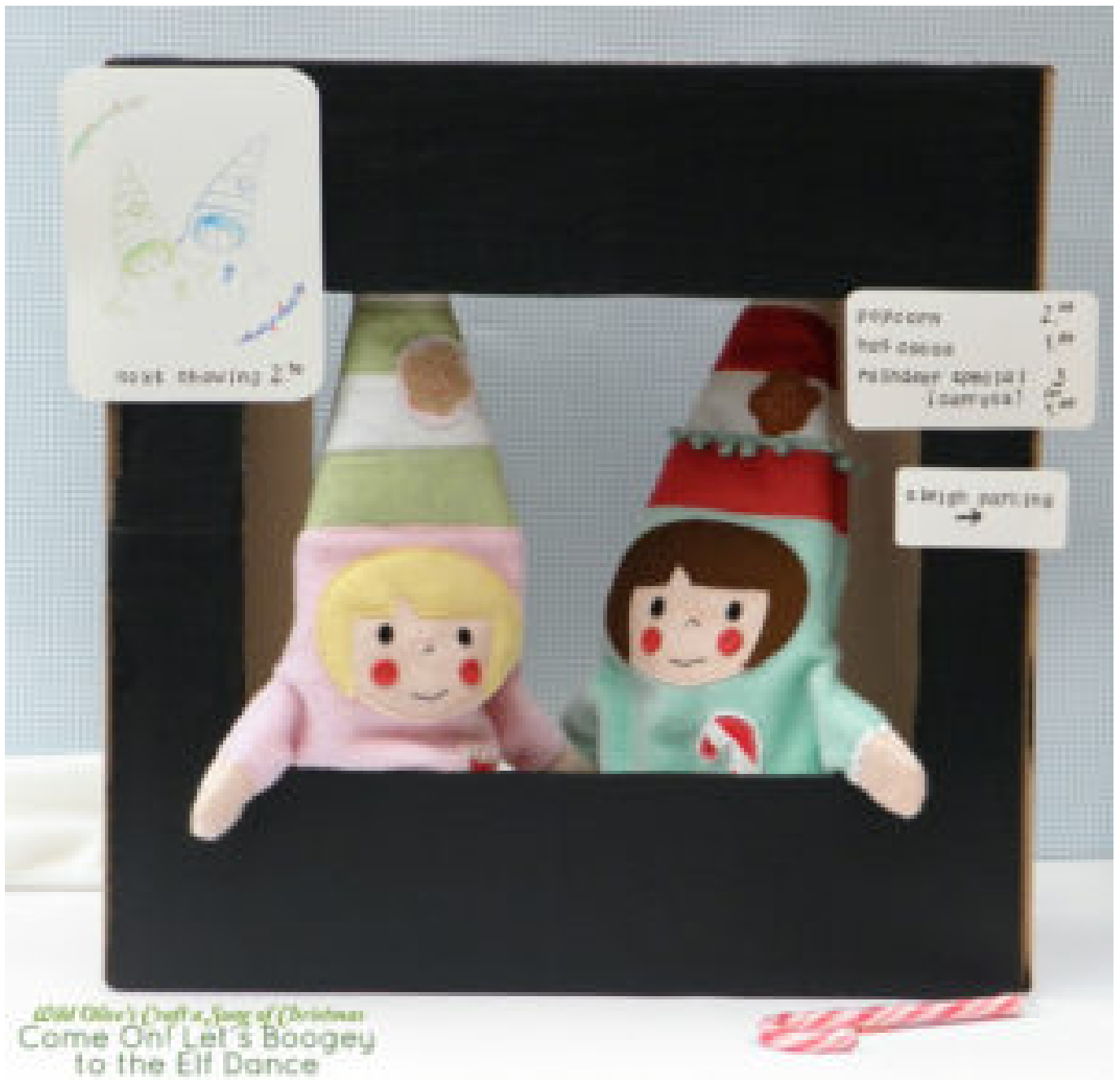
Elf Dance Puppets - by: Wild Olive

And this Christmas Ornament: Snowflake Mitten