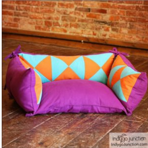
Pieced Pet Pillows Pattern