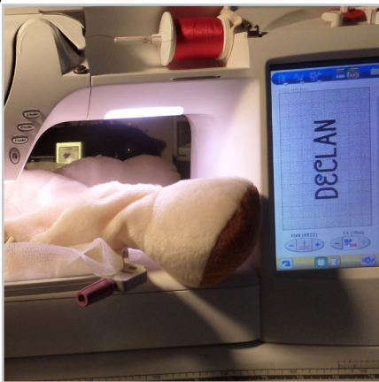
Ensure text is turned