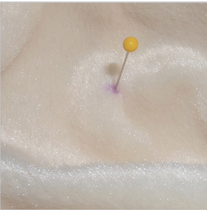
Pin inserted into marked dot