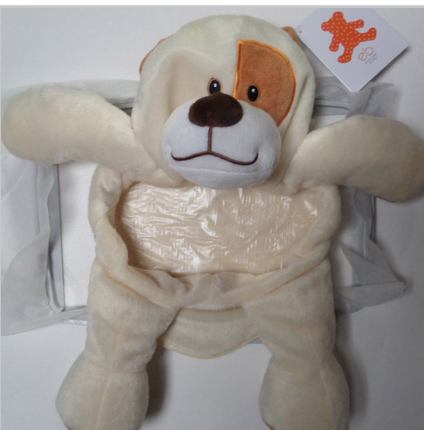
Solvy applied to area

3. Mark the center of the Embroider Buddy. I came down about 1" from the neck seam.