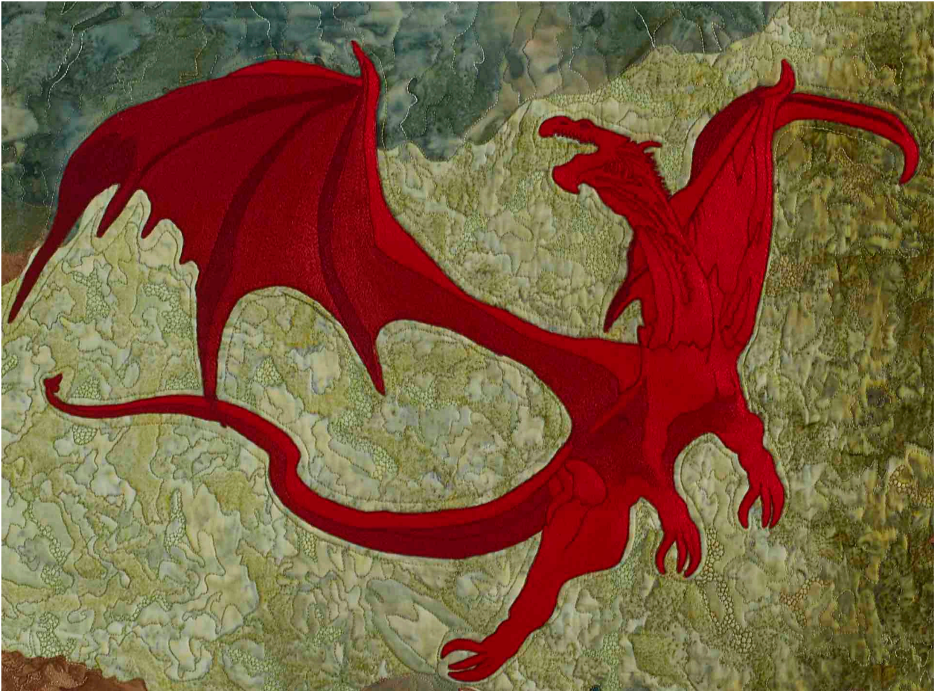
One of Eric's thread-sketched dragons.